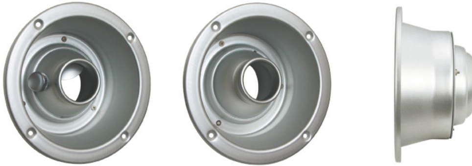
Model: PK-AD (with Damper)