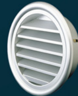
Model SXL 10"-16" Aluminum