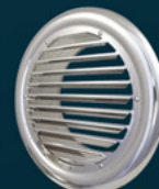
Model SX-S 4" & 6" Stainless Steel