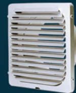
Model KX 3"-6" Aluminum