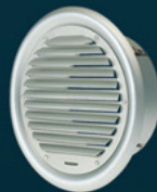
Model SX 3"-8" Aluminum