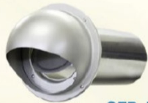
Model: SFB-P 4" & 6" Aluminum