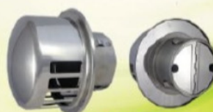
Model: RCC-S 4" & 6" Stainless Steel