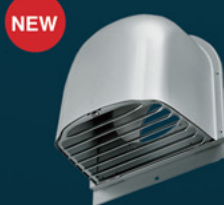
Model CFX 3"-12" Aluminum