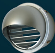
Model SFZ 4" & 6" Aluminum