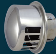
Model RCC-S 4" & 6" Stainless Steel