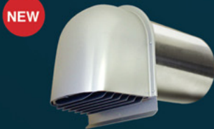
Model CFX-P 4" & 6" Aluminum