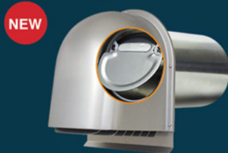
Model: CFXF-P 4" & 6" Aluminum