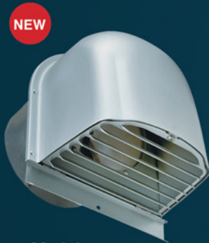
Model CFXC 4" & 6" Aluminum