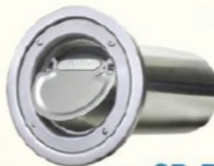
Model: SB-P 4" & 6" Aluminum