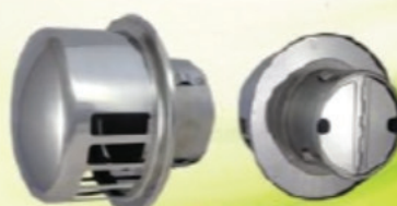
Model: RCC-S 4" & 6" Stainless Steel