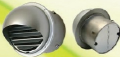
Model: SFZC 4" & 6" Aluminum