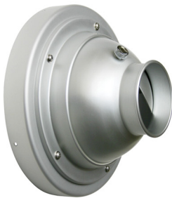
Model: PK-R (Exposed Duct Mounted)