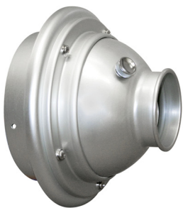
Model: PK-RA (Wall/Spiral Duct Mounted)